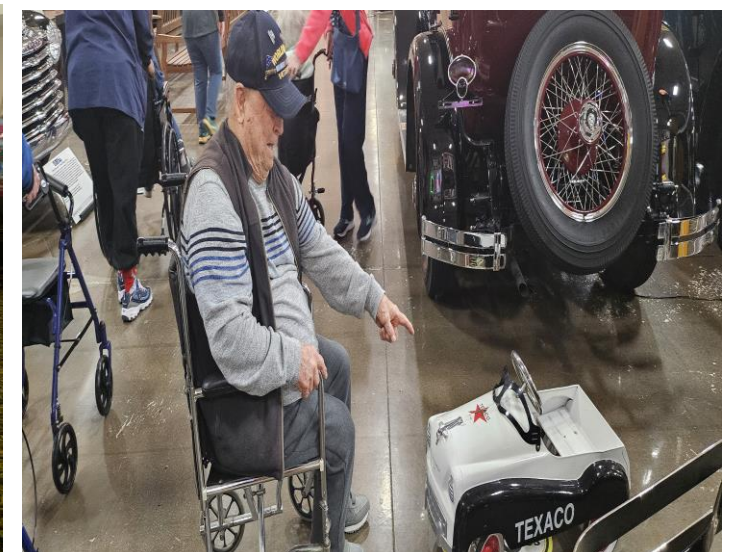
Stahl's Auto Museum