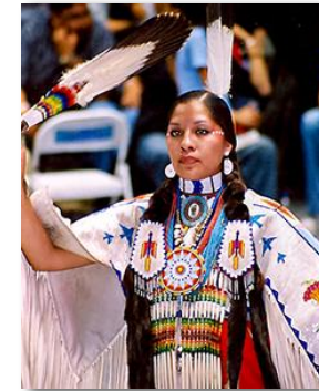
Dancers compete in categories such as Traditional, Fancy, Grass, and Jingle.

From April 24–25, Albuquerque, New Mexico, will host one of the largest gatherings of Indigenous Americans in the world when more than 700 tribes from the United States, Canada, and beyond arrive for the Gathering of Nations Powwow. First held more than 40 years ago, the Gathering of Nations has grown into the premier Native American cultural event in North America. Sadly, organizers have announced that the 2026 powwow will be its final year—"The Last Dance."